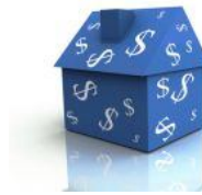
House and dollar signs

Median single-family existing-home prices rose in about 20 percent of the 149 markets tracked by the National Association of Realtors in fourth-quarter 2011 compared to the same quarter in the previous year, and Florida and Texas are home to nine of the 29 metros with positive growth.