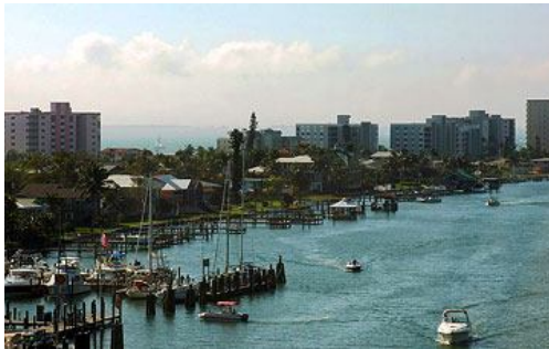
Euku at en.wikipedia